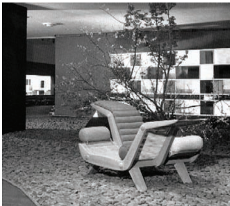
Charlotte Perriand's postwar furniture displayed in the exhibition Synthesis of the Arts, Takashimaya department store, Tokyo, 1955.

A pair of chaises will be arranged parallel to each other, in opposite directions, so the diners will face each other. This condition creates a bubble that frame close and daydream interac-tions. The chaise lounge resemblance a body lay down at the sun. Many restaurants have big windows, or in summer the windows are open; the restaurant is treated as an "outdoor" space (public, in the sense of open to the view) while being indoors (for weather reasons).