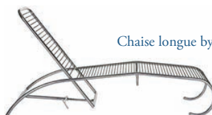
Chaise longue by René Herbst, France, 1931.